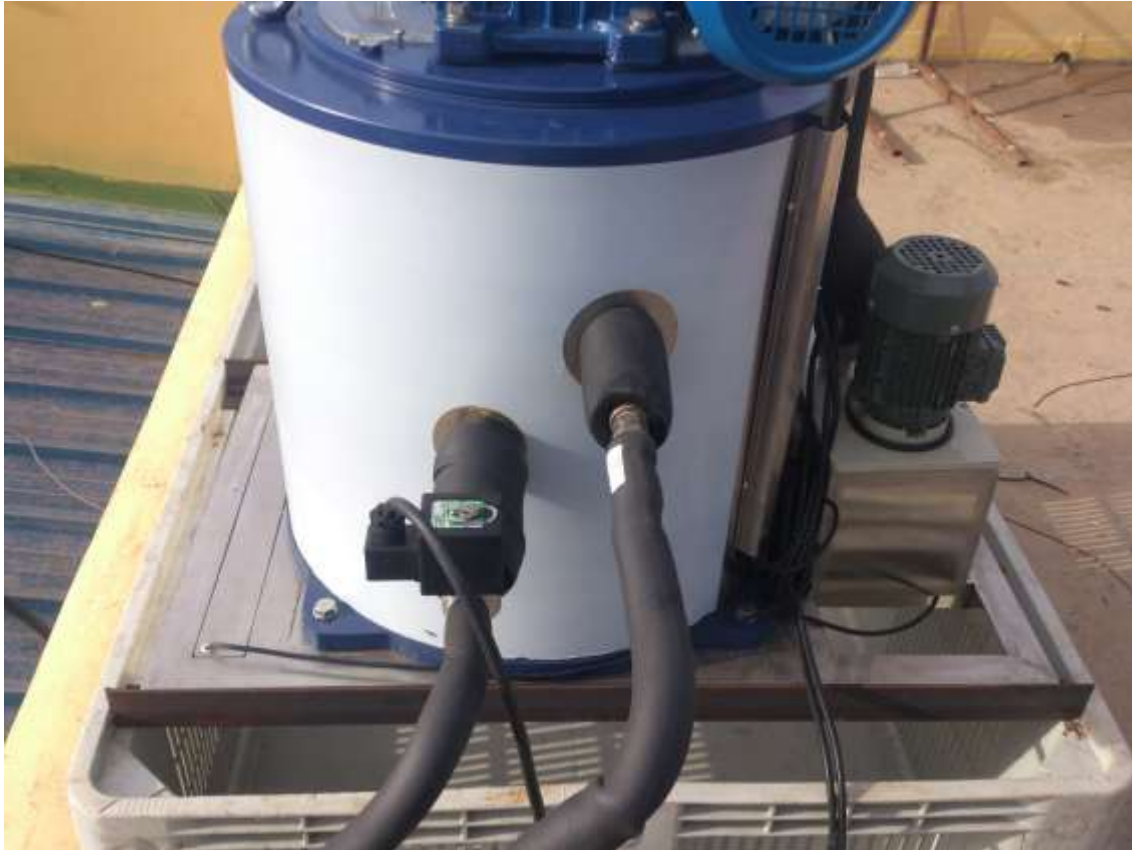
Figure 7 . Image of the flake ice maker (evaporator of the absorption refrigeration system)