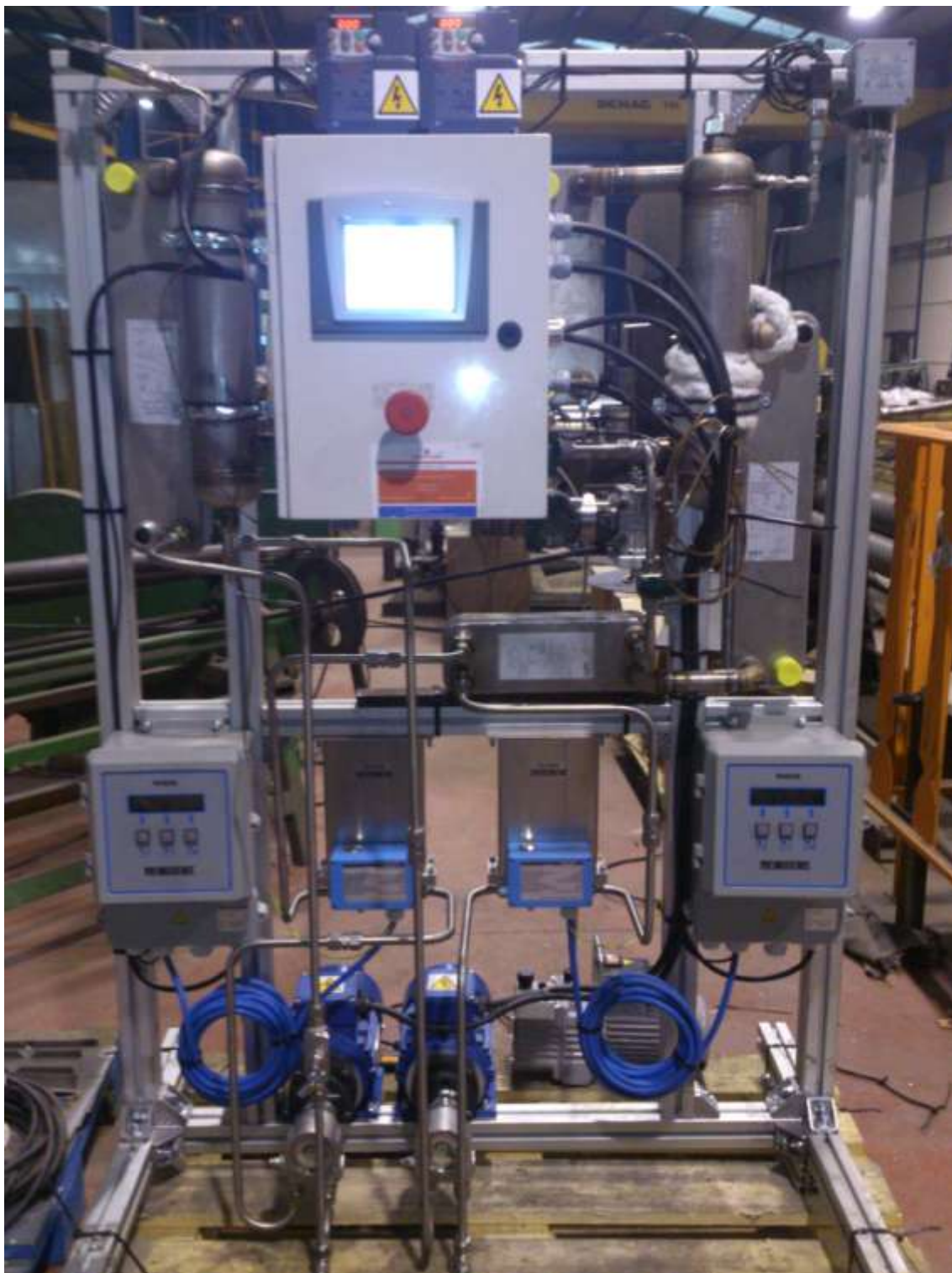
Figure 6 . Image of the absorption machine for thermo-chemical NH 3 vapor compression.