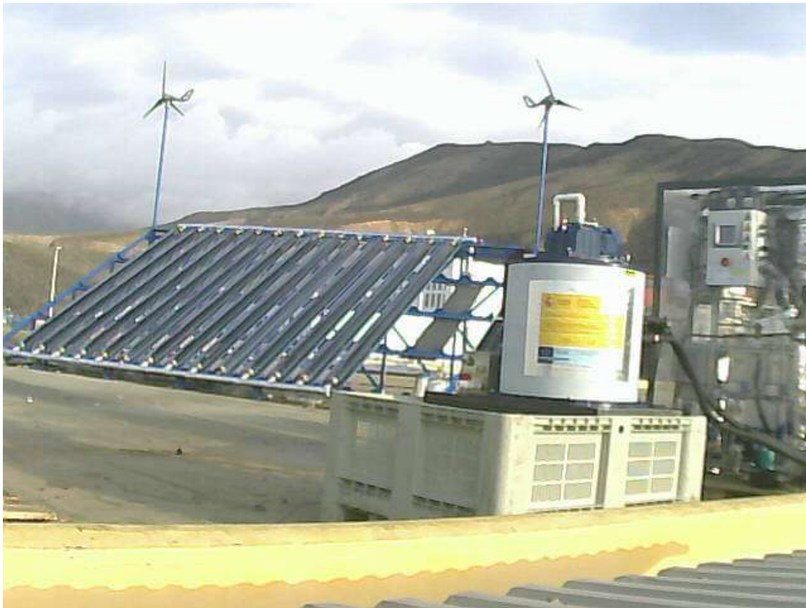
Figure 8 . Image of the complete installation. Live view at www.demede.es/investigacion.html