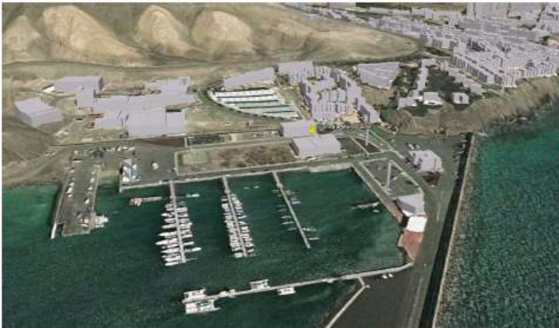
Figure . Image of surroundings of Morro Jable Port, and Fishery (in yellow)