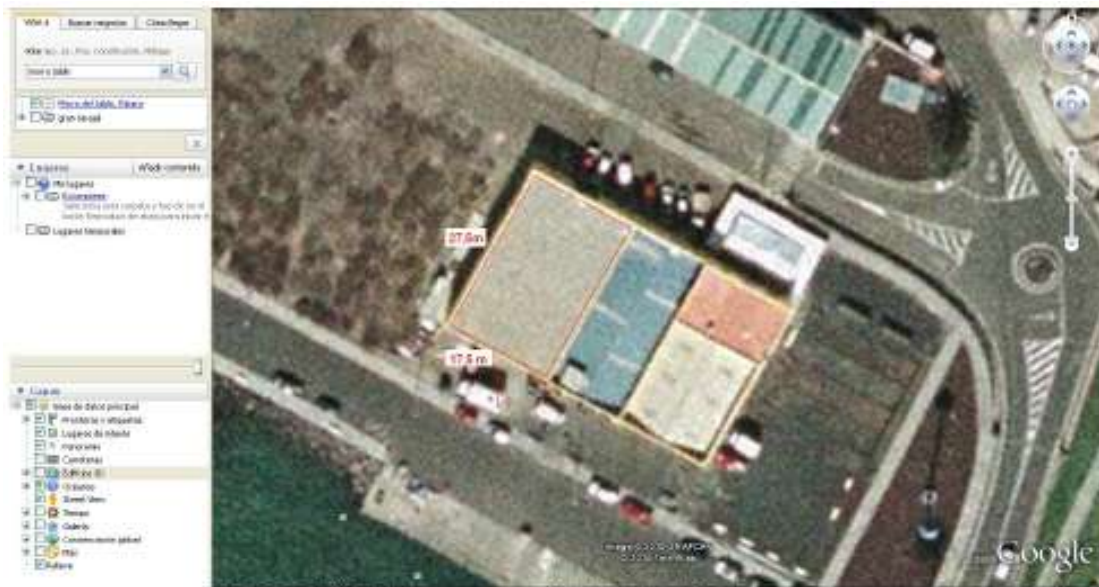
Figure . Satellite image of Morro Jable Fishery at Fuerteventura Island