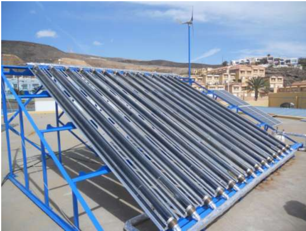
Figure . Image of the installation